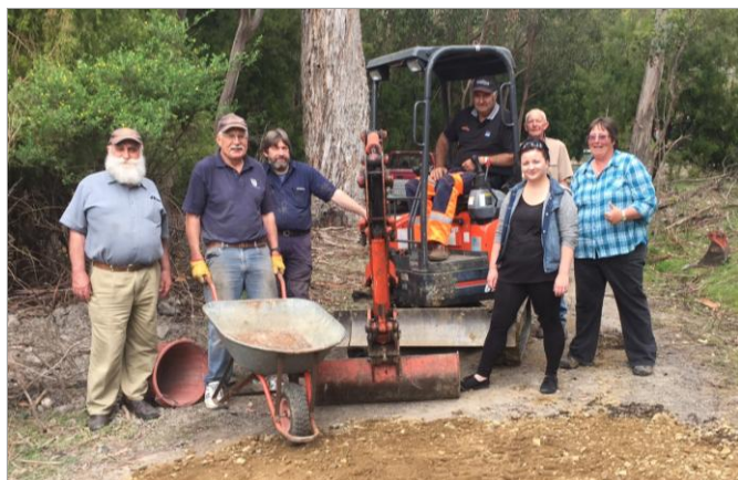
An energetic crew at a recent Mitchell Range working bee.

Thanks to all volunteers and those who achieved so much at working bees on both ranges.