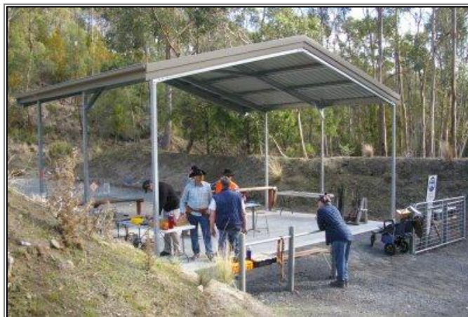
Western Action cowboys take cover on Range B