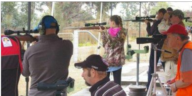
Twenty one shooters competed for titles in Silhouette, Hunter, 2 Gun, 3 Gun, and Air Rifle classes.