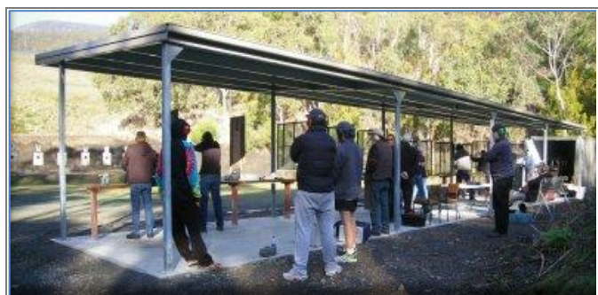
All weather comfort.