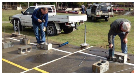
New RMS benches