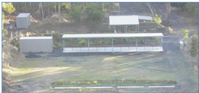
Two new containers and three covers.

After more than eight years planning, the Mitchell Range Shelter and Storage Project is nearly complete, providing two new containers, concrete pads and cover for the three firing lines. This has been a Strategic Plan priority and can now be enjoyed by the members. Rain, hail or shine, the range will be open.