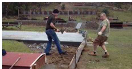
Safer access to the 25m firing line.