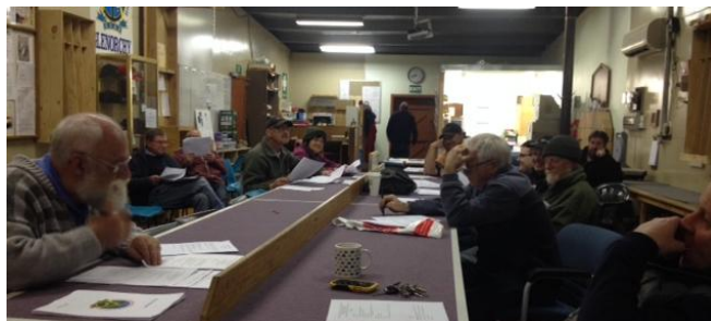
Thanks to those who attended the 2016 AGM

Special Business – The special business of the AGM was to adopt the amended version of the Branch Constitution which was done unanimously. One interesting amendment allows SSAA clubs to accept members from branches other than their own. At our discretion, SSAA Glenorchy Inc could accept Individual members from the T03 branch, other branches or SSAA Tasmania T50. It is not the committee's intention to exercise this discretion. The new constitution (Version 2) is available on the club website.