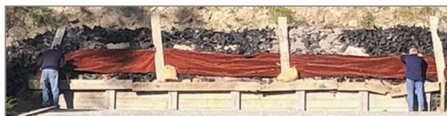
The left half of Range A's butt has been covered with shredded tyre and smartened up for Tas Police and club use.