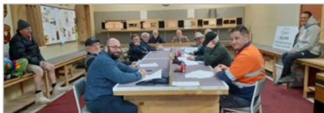
2022 AGM – Relaxed and not too long.

The 2023 Annual General Meeting of SSAA Glenorchy Inc will be held at the AIF clubrooms on Monday 28 th August at 7.30 pm. Reports from the President and Treasurer will be tabled, and new office bearers elected. As explained in Bull Barrel Vol 58, the club has not engaged a professional auditor for the 22-23 financial year. Supper is provided. Anyone who is interested in nominating for a position and would like to come to a committee meeting in June, July or August should see the Secretary.