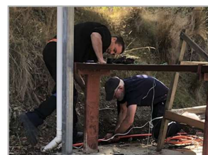
A new wall between Range B and Range C firing lines and finishing touches to the underground turning target cables.